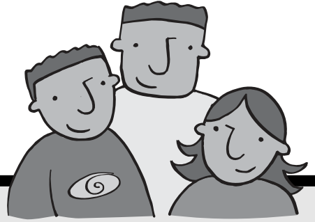
Table Talk helps children and adults explore the Bible together. Each day provides a short family Bible time which, with your own adaptation, could work for ages 4 to 12. It includes optional follow-on material which takes the passage further for older children. There are also suggestions for linking Table Talk with XTB children's notes.